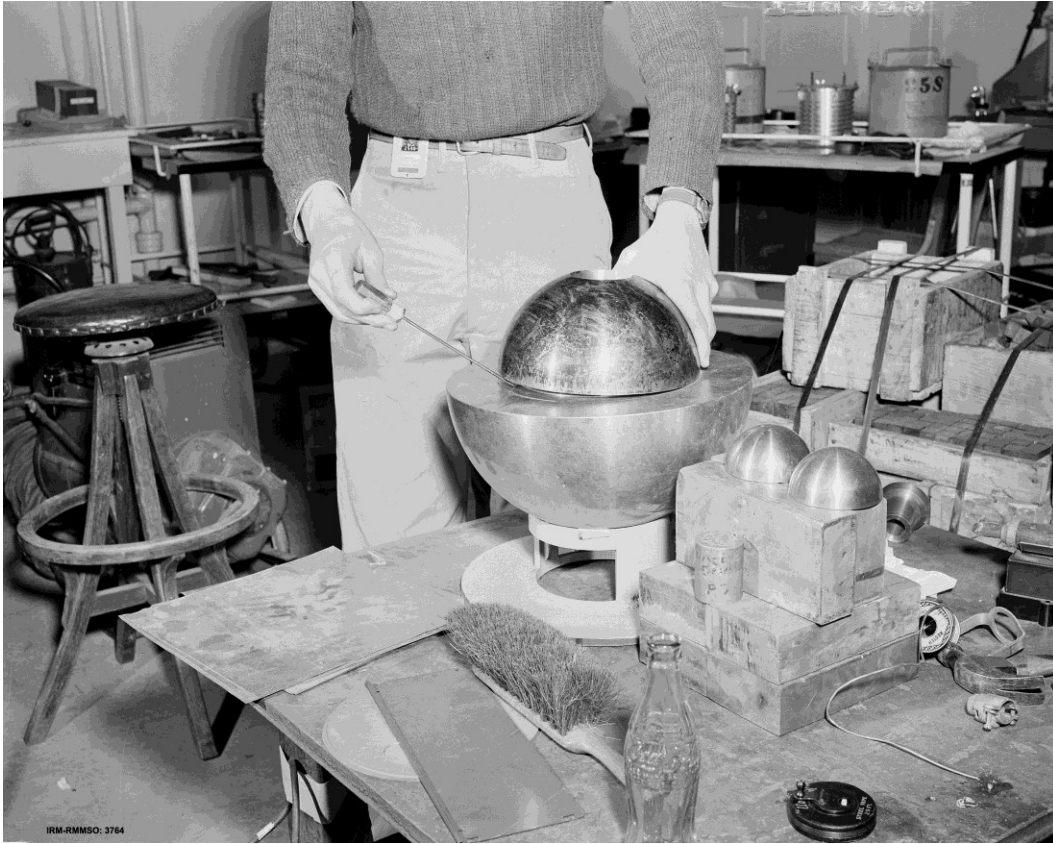
Slotin accident mock-up.jpg: In this “tickling the tail of the dragon” experiment, Louis Slotin moved the top of the plutonium-containing half-sphere with his thumb in the hole and kept the two half-spheres separated with a screwdriver (a violation of the experimental protocol)

(As published in The Oak Ridger's Historically Speaking column on January 18, 2016)